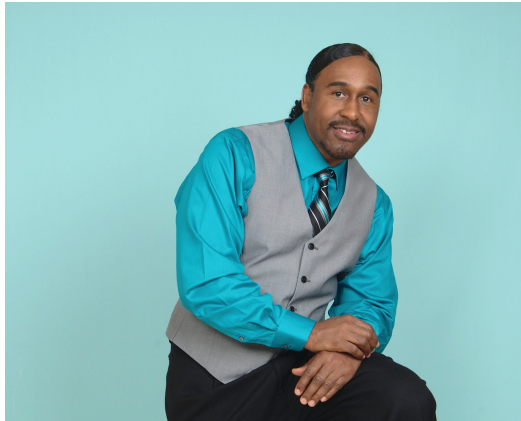
Photo Permission and Usage. My legal permission must first be granted for usage of any of this photography. I understand that with my permission these photographs may be used in any publication, print ad, direct-mail piece, electronic media (e.g. video, Internet, Web site) or other form of promotion in perpetuity. I warrant that I hold all rights to these photographs, including the right to freely release the image for reproduction and/or repurposing without remuneration or profit and I will make no monetary claim for the use of these photographs.